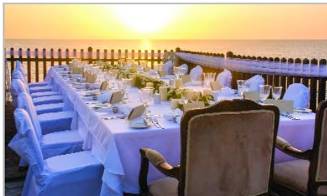
A beautifully dressed reception table