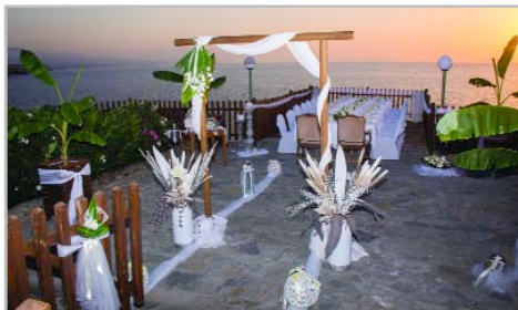
Such a romantic setting for your evening reception!