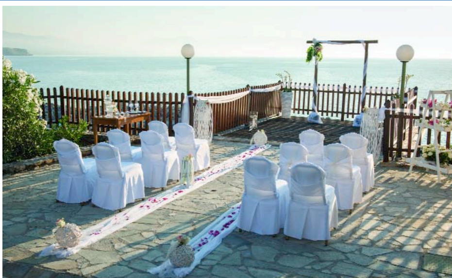
A whole range of 'extra touches' can be added to the ceremony set-up